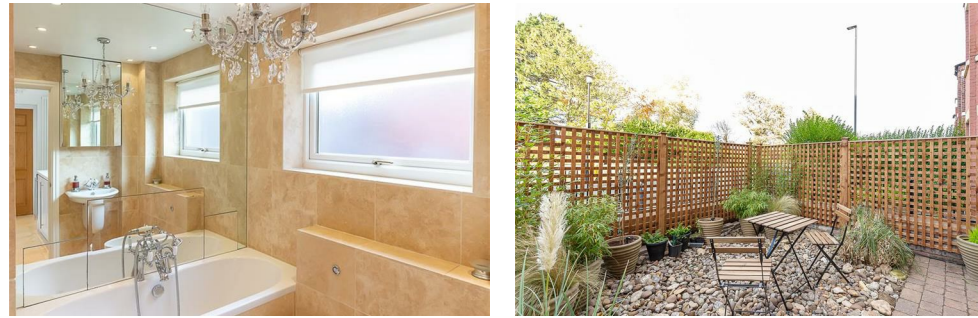
GROUND FLOOR 680 sq.ft. (63.1 sq.m.) approx.

IMPORTANT NOTE: These particulars and the descriptions and measurements herein do not constitute representation and whilst every effort has been made to ensure accuracy, this cannot be guaranteed.